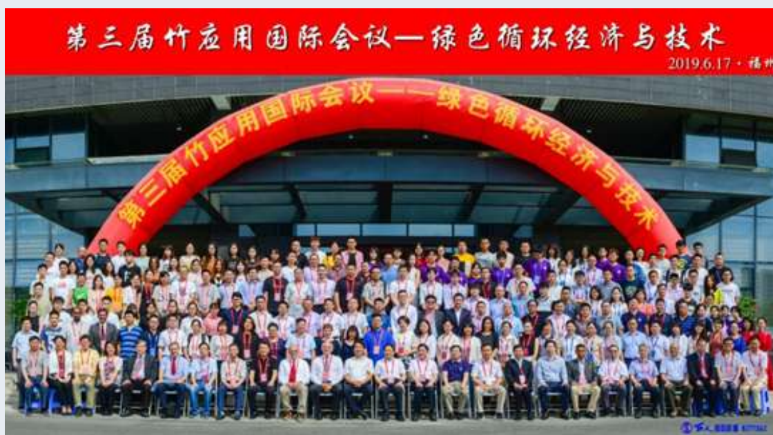
Group photo of the conference attendees

June 16-18, 2019, Fuzhou University (Qishan Campus), Fuzhou, People's Republic of China