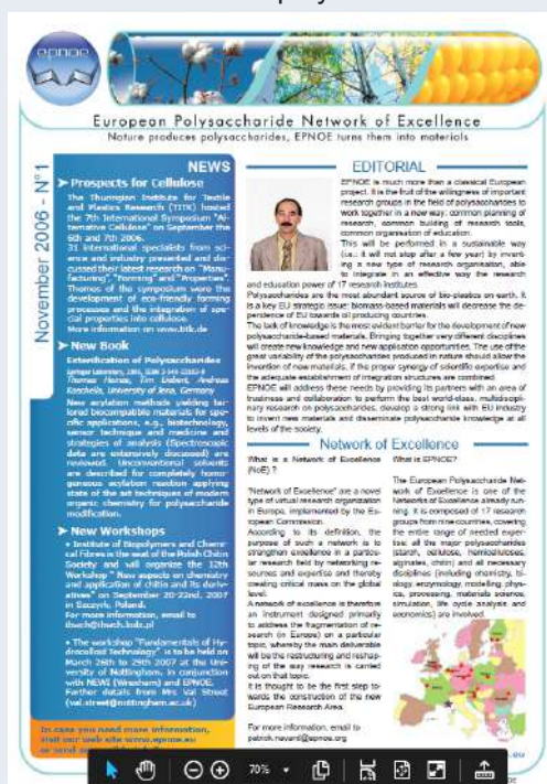
First EPNOE Newsletter issue, November 2006

The first EPNOE Newsletter was published in November 2006. The next issues appeared with a periodicity of 3-4 issues per year. Since 2016, EPNOE Newsletter is published every two months, giving news of EPNOE members to more than 1100 subscribers all over the World. It is strong link between scientists involved in polysaccharide research.